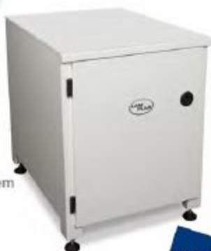
Podstavec s úložným prostorem