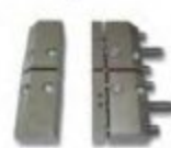
Dvojitý šroubový upinač