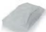
Tkaninový filtr pro recirkulační jednotku