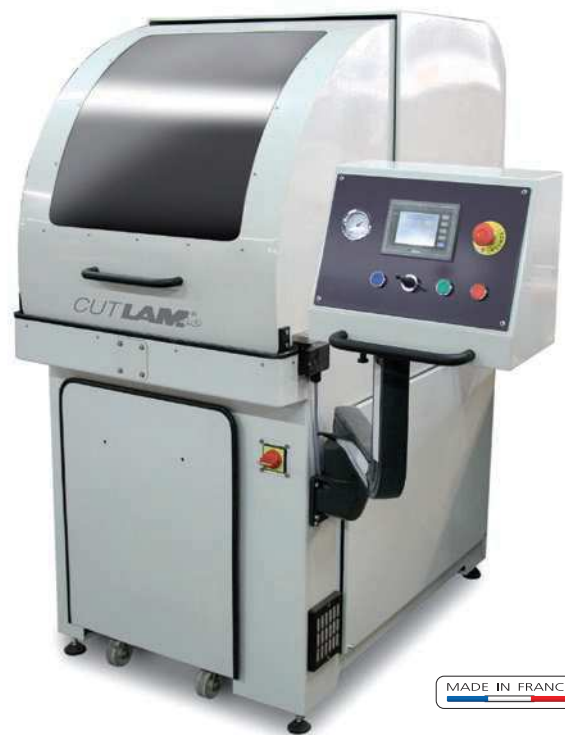
CUTLAM ® 4.0 - Ø 400 mm