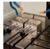
60 CT501 00