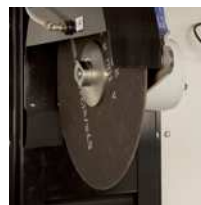
60 CT503 00