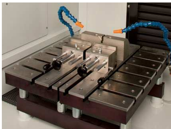
A spacious cutting chamber: W 408 x D 422 mm with openings on both right and left sides for the cutting of long samples.