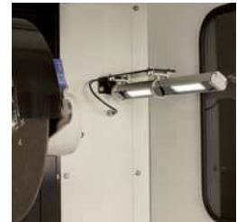
Work area lit by LED strip