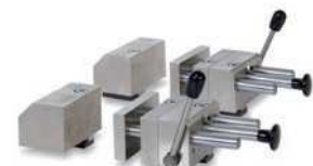
60 CT400 20