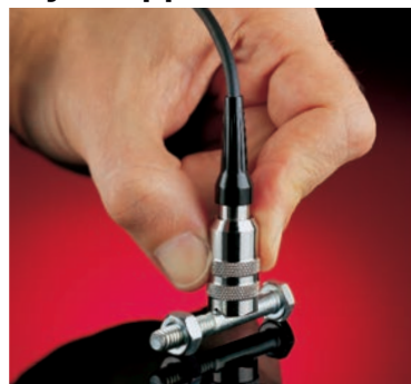
...and for measuring galvanizing, plating, anodizing, and more.