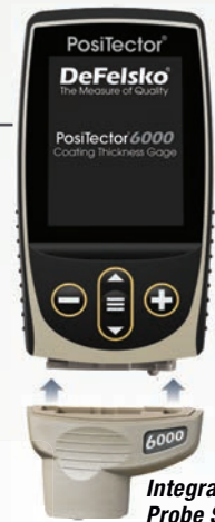
Integral Probe Style