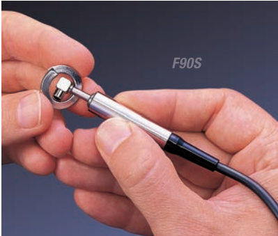
Microprobe series for small parts and hard-to-reach areas