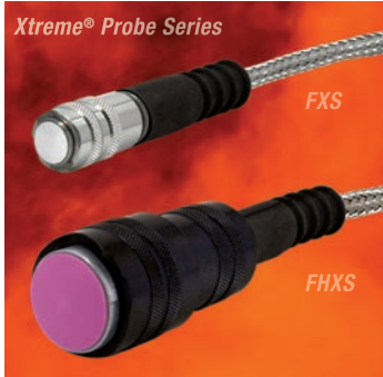
Xtreme® Probes with Alumina wear faces and braided cables for hot/rough surfaces