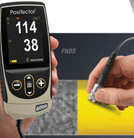
Duplex Probe measures individual layer thicknesses of zinc and paint in a duplex coating system