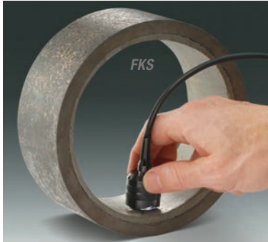
Thick Probe series for thick protective coatings: epoxy, rubber, fireproofing, and more