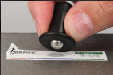
For use with Testex™ Press-O-Film™ Replica Tape

Measures and records surface profile parameters using replica tape