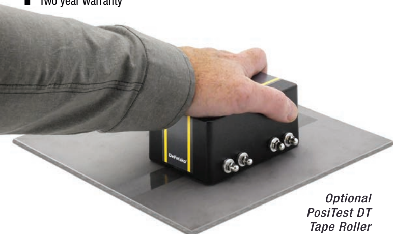
Optional PosiTest DT Tape Roller

Conforms to ISO 8502-3, AS 3894.6, US Navy PPI 63101-000