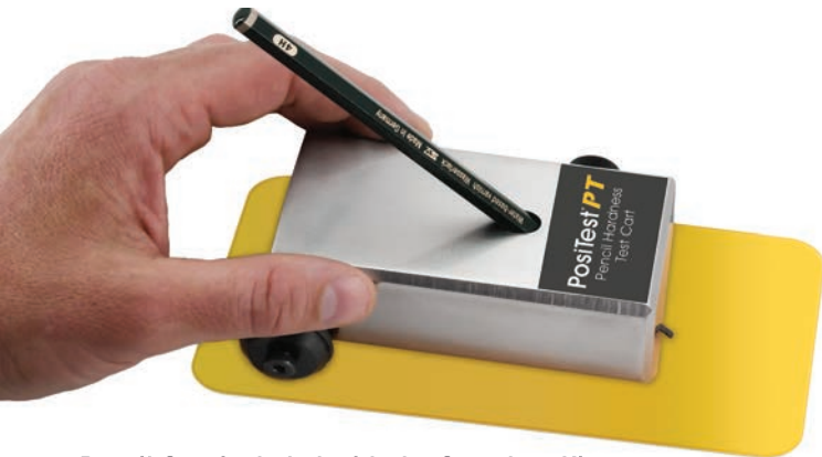
Pencil Cart included with the Complete Kit