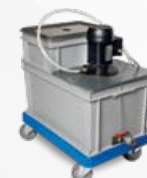
Recirculation system 60 L