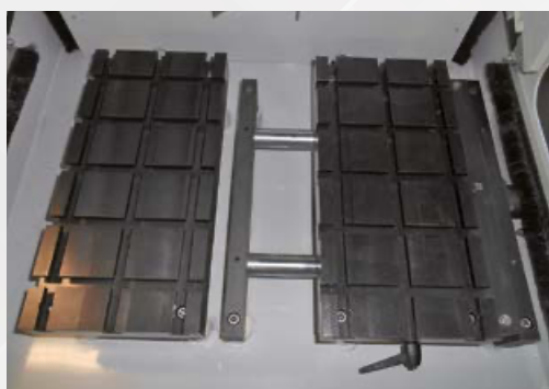
Transversal table X axis 120 mm stroke