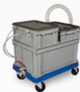
60 A0029 00