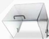
60 MLEP1 00