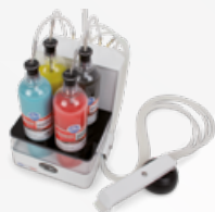
60 MLD00 00