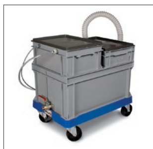
Sedimentation tank 30L with pump controlled by the machine